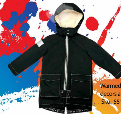
Warmed coat with LED decors and fur lining Sku.: 551.20