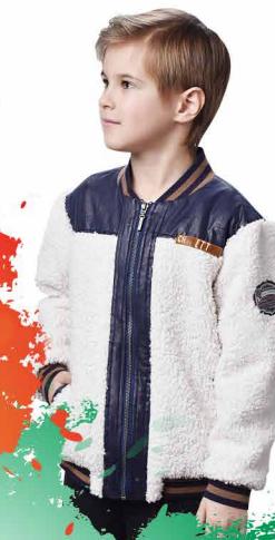
Sheep fur bomber jackets Sku.: 01.82 Bomber

The new dynamic collection for boys «Drive» reflects all last fashion trends: fonted prints, bright plaid and volume chevrons.