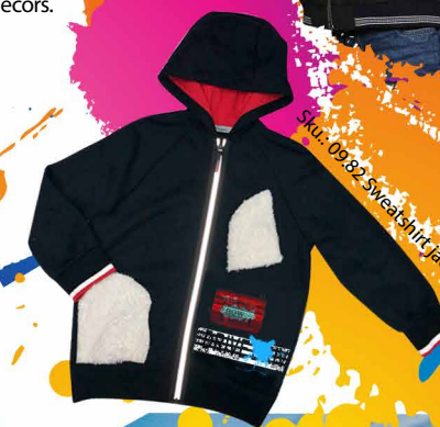
Sku.: 09.82 Sweatshirt, jacket