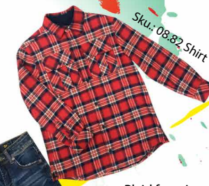
Sku.: 08.82 Shirt