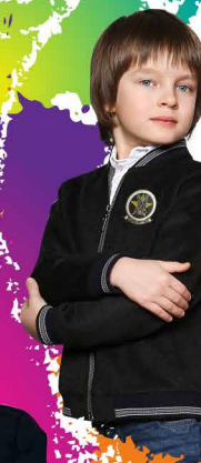
Sku.: 04.82 Sweatshirt, jacket

Each model is thought through very carefully taking into account child's way of life and activity.