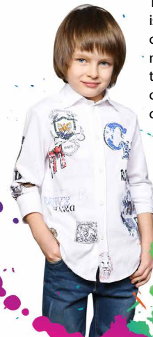
Sku.: 05.82 Shirt with print

The universal design which is concisely combining convenience of easy movements and fashion trends in itself — the main concept of the «Drive» collection.