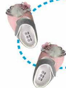
Slippers in assortment