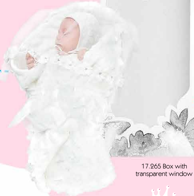
1053.43 Elegant blanket