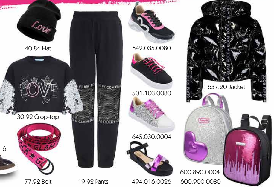
1. 1191.1.43 Dress | 2. 14.92 Jacket | 3. 1190.43 Dress | 4. 26.92 Jacket, 27.92 Skirt | 5. 30.92 Crop-top, 21.92 Culottes | 6. 07.92 Shirt, 28.92 Pants

Completing the look with stylish accessories