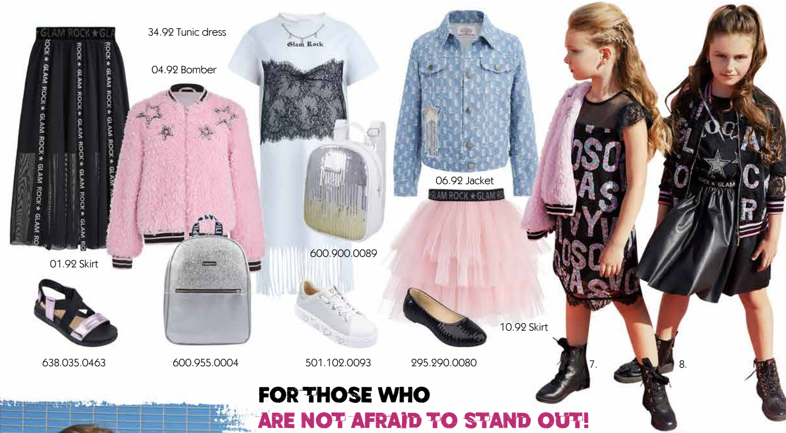
01.92 Skirt 638.035.0463 04.92 Bomber 600.955.0004 34.92 Tunic dress 600.900.0089 06.92 Jacket 501.102.0093 10.92 Skirt 295.290.0080 7. 8.

FOR THOSE WHO ARE NOT AFRAID TO STAND OUT!