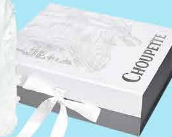
19.265 Gift box

Where have you been before? - was my question when I found out that Choupette launched such a cool service. You have no idea how BABY SHOWER will simplify your life and make gifts truly desired.