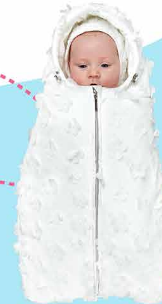
1056.143 baby nest