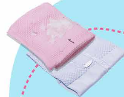
Blankets in assortment