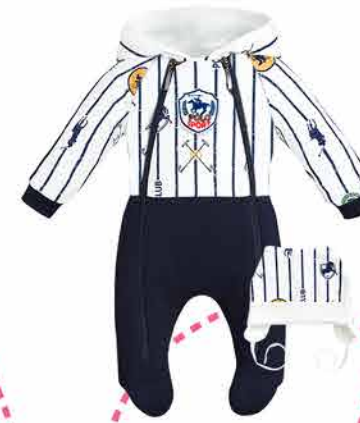
17.95 Set (Overalls, bonnet)