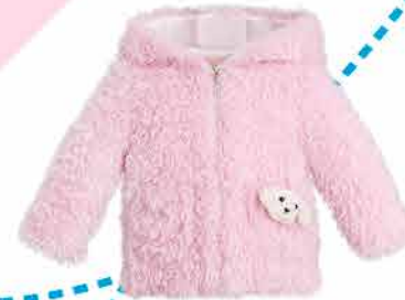
47.92 Jacket from fluffy jersey