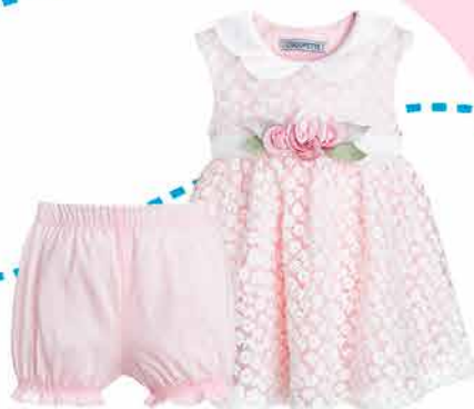
Set (dress & shorts)