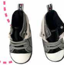
Slippers in assortment