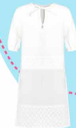
96.143 Christening gown