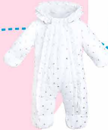
634.20 Warm overalls with polyester filler