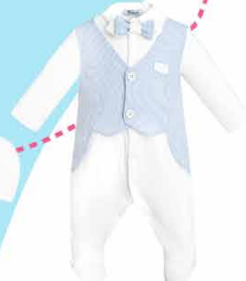
1167.43 Set (Overalls, bonnet)

The manufacturer reserves the right to change the design of the products without quality loss. The publication is of an advertising nature and is not a public offer.