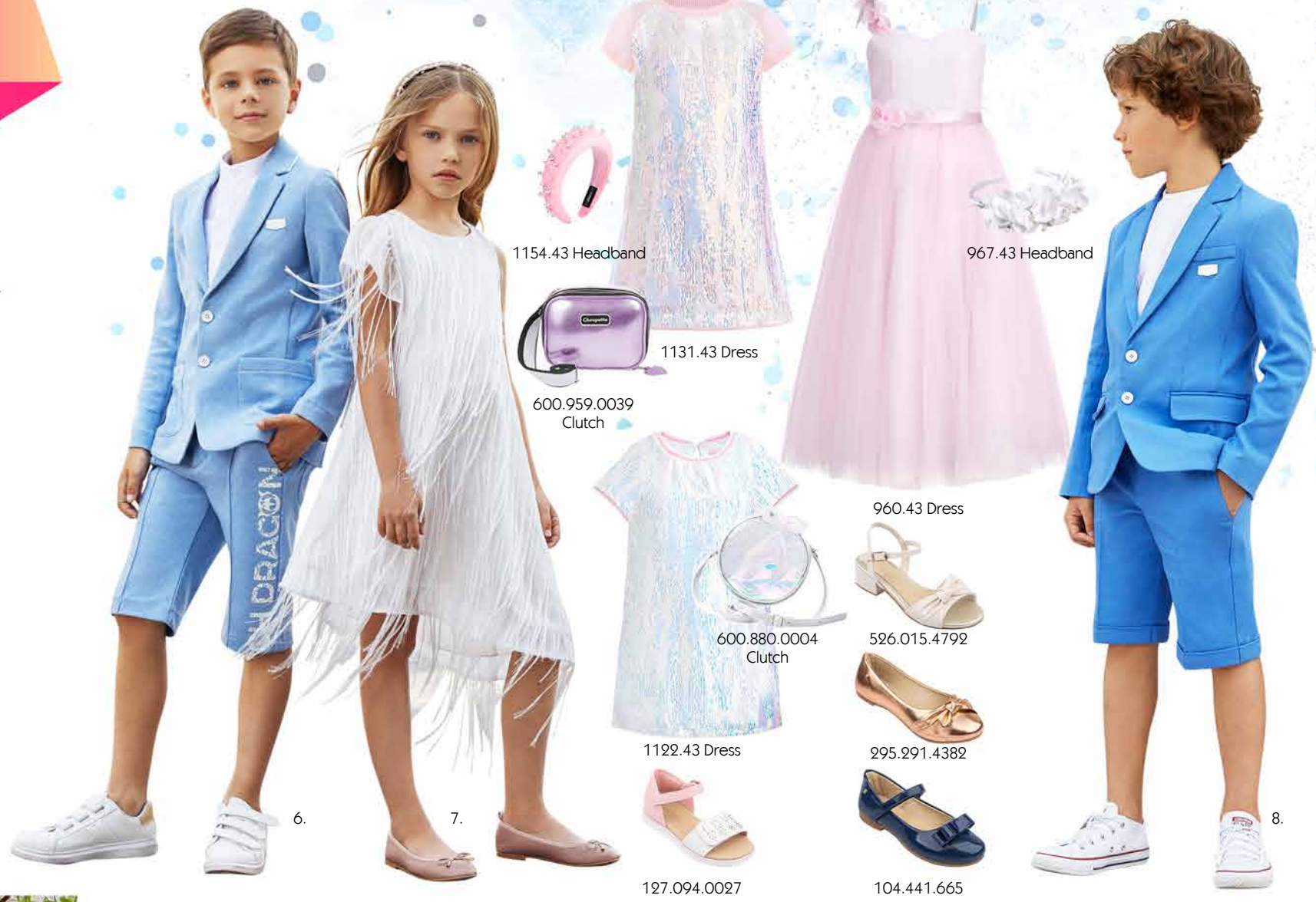
1. 1193.43 Dress | 2. 1194.43 Dress | 3. 1151.43 Dress | 4. 368.1.43 Bow-tie , 929.43 Vest, 939.43 Shirt, 931.43 Shorts | 5. 1149.43 Dress, 969.43 Headband 6. 933.43 Jacket, 941.43 Shirt, 934.43 Shorts | 7. 1132.43 Dress | 8. 1138.43 Jacket, 943.43 Sweatshirt, 1140.43 Shorts

Linen clothes in summer are the most suitable because flax is not only the most Eco-friendly and versatile, but also the most stylish material for warm season 2021. You can complete your look with a light shirt and white trainers or sneakers.