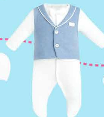
1010.43 Set (Overalls, bonnet)