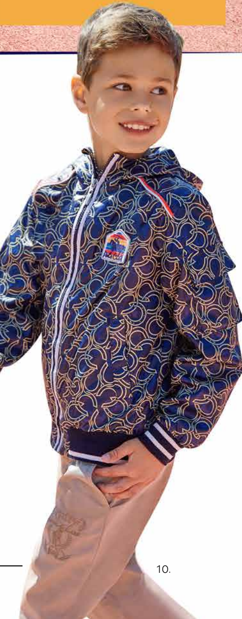
1. 5. 08.93 Sweatshirt, 269.70 Jeans | 2. 05.93 Bomber | 3. 22.93 T-shirt | 4. 16.93 Sweatshirt, 269.70 Jeans | 5. 08.93 Sweatshirt | 6. 21.93 T-shirt, 08.95 Pants