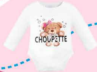
59.92 Longsleeve bodysuit