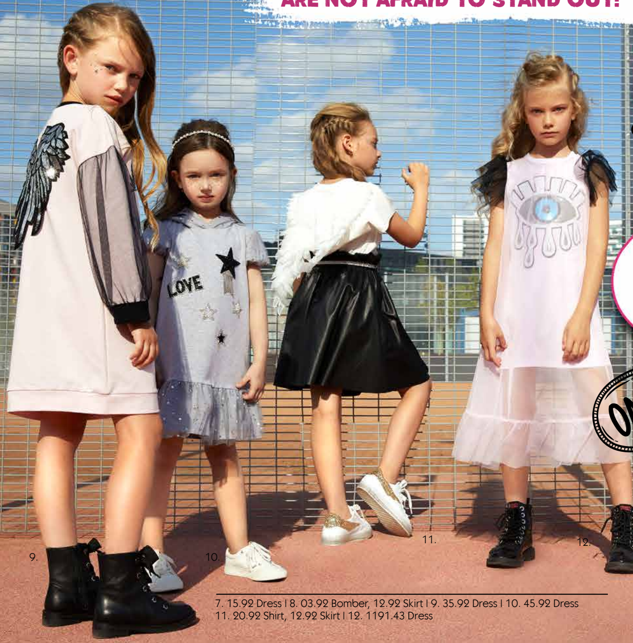
9. 15.92 Dress | 8. 03.92 Bomber, 12.92 Skirt | 9. 35.92 Dress | 10. 45.92 Dress | 11. 20.92 Shirt, 12.92 Skirt | 12. 1191.43 Dress

FOR THOSE WHO ARE NOT AFRAID TO STAND OUT!