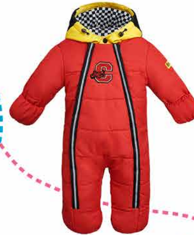
632.20 Warm overalls with polyester filler