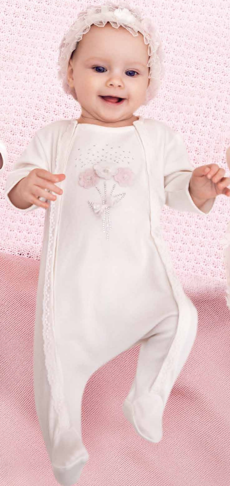
Anna, 6 months: Flower Embroidered Coverall, squ 59.67 Headband, squ 63.67