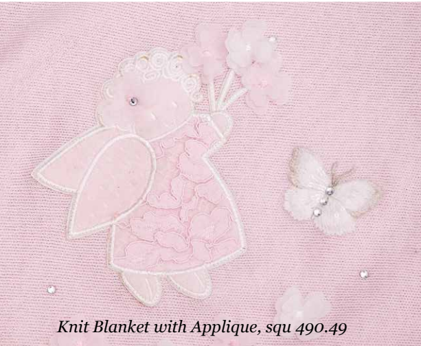
Knit Blanket with Applique, squ 490.49