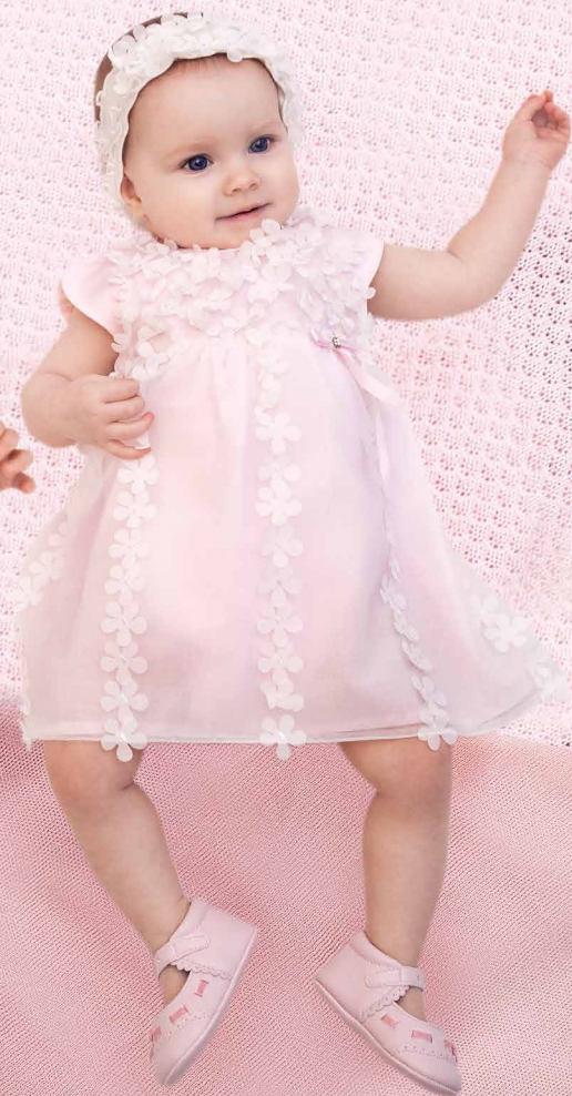
Anna, 6 months: All Over Flowers Bodysuit-Dress, squ 60.67 Headband, squ 64.67 Booties, squ 836.43