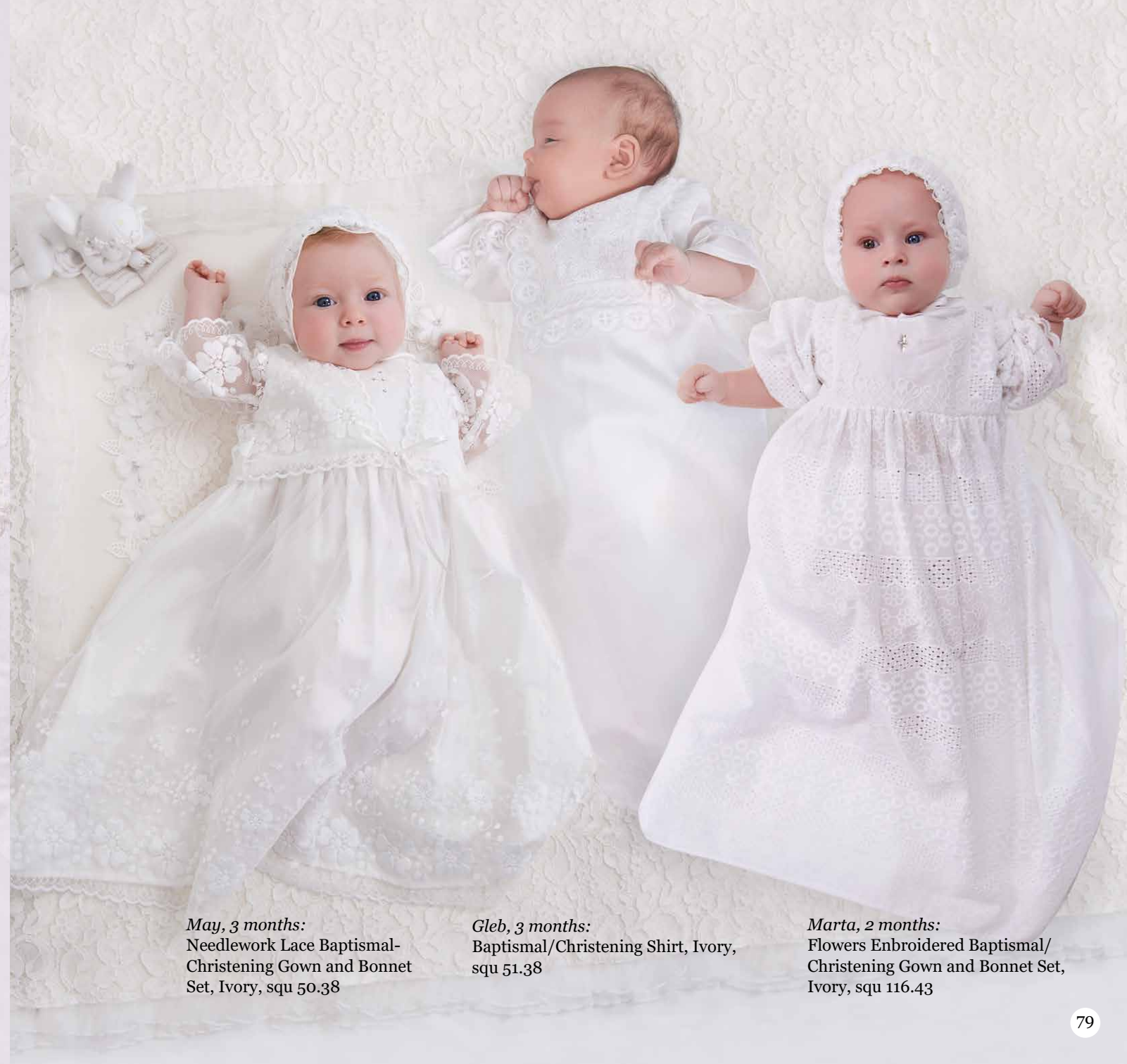
May, 3 months: Needlework Lace Baptismal- Christening Gown and Bonnet Set, Ivory, squ 50.38