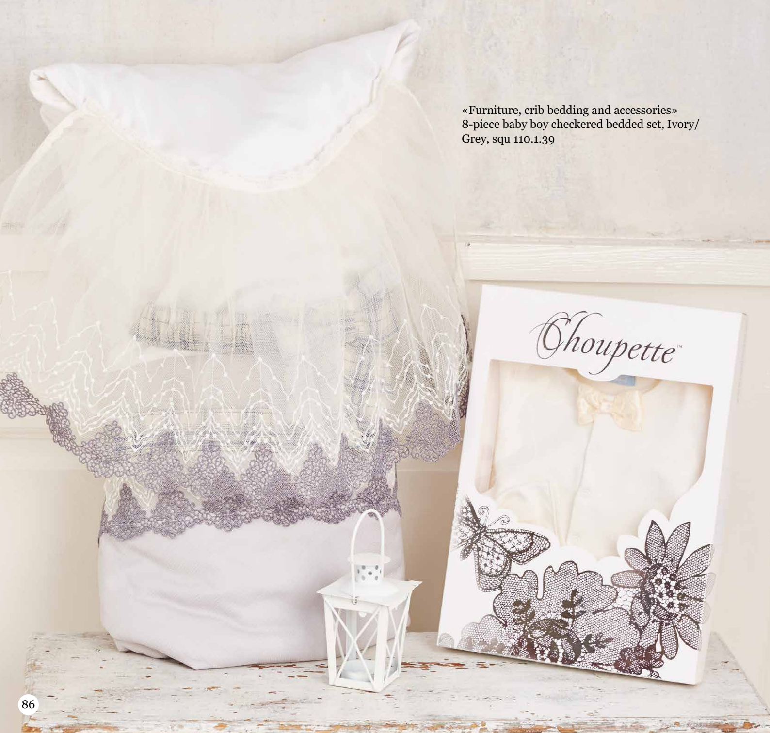
«Furniture, crib bedding and accessories» 8-piece baby boy checkered bedded set, Ivory/ Grey, squ 110.1.39