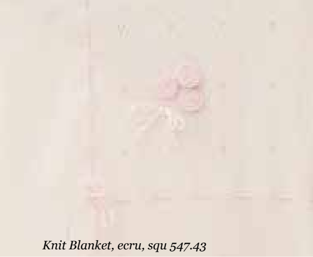
Knit Blanket, ecru, squ 547.43