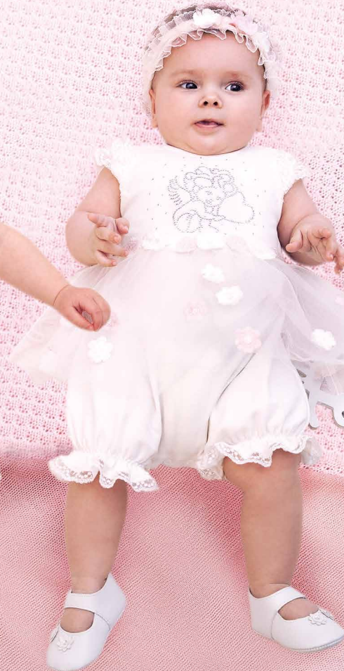
Olga, 7 months: Floral Embroidered Skirt Playsuit, squ 56.67 Headband, squ 63.67 Booties, squ 810.43