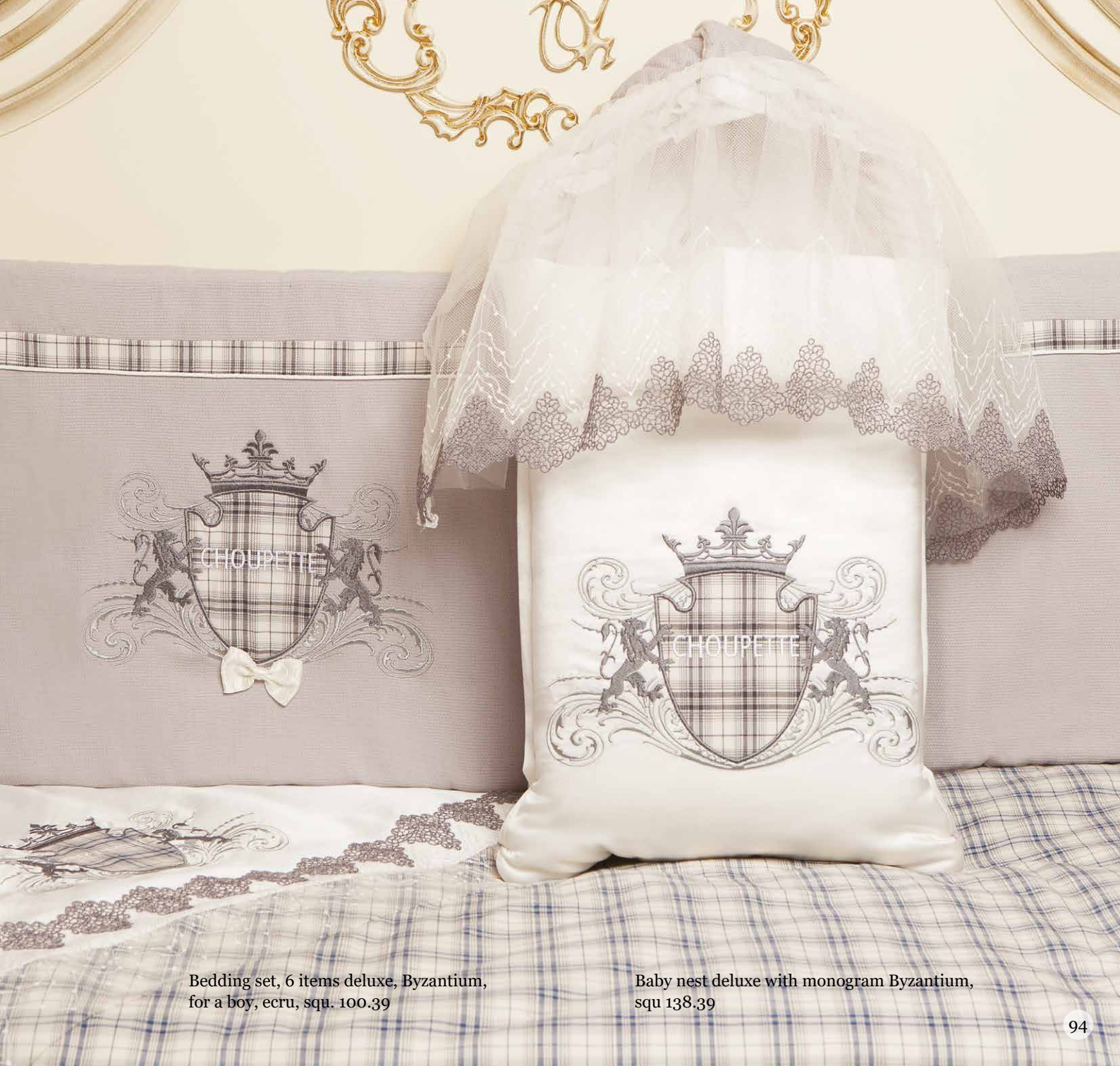
Baby nest deluxe with monogram Byzantium, squ 138.39