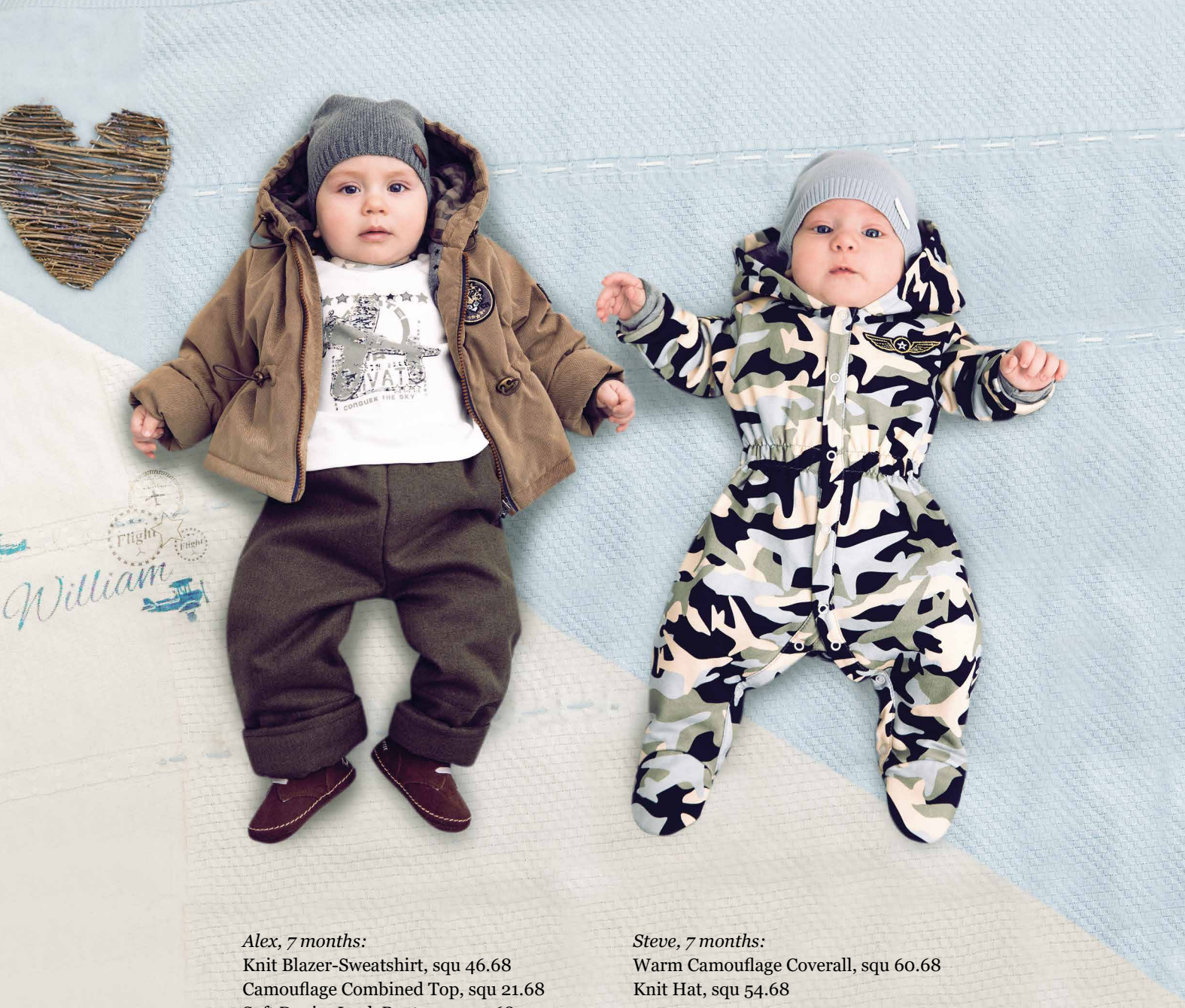
Alex, 7 months:

Knit Blazer-Sweatshirt, squ 46.68 Camouflage Combined Top, squ 21.68 Soft Denim Look Pants, squ 44.68 Knit Hat, squ 54.68 Booties, squ 833.43