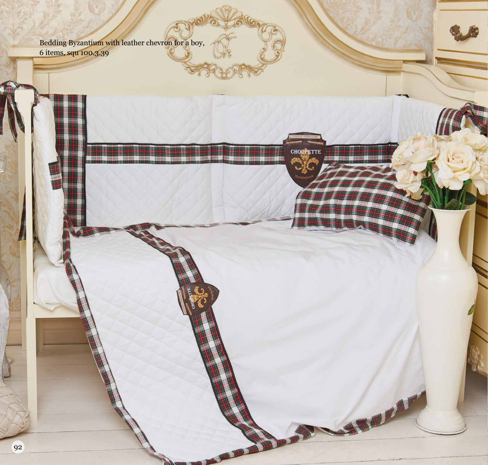
Bedding Byzantium with leather chevron for a boy, 6 items, squ 100.3.39