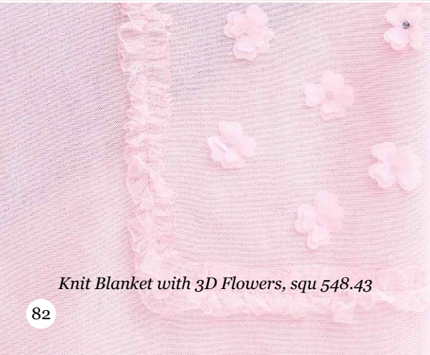
Knit Blanket with 3D Flowers, squ 548.43