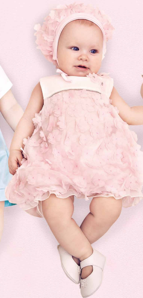
Sveta, 6 month: All Over Flowers Dress, Pants and Bonnet Set, squ 543.43 Booties, squ 810.43