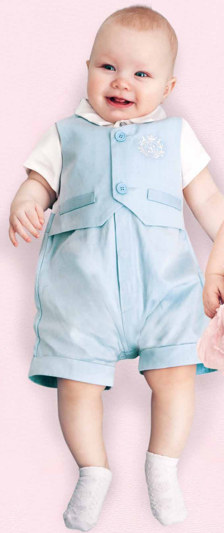
Alex, 7 month: Vest and Short Imitation Playsuit, squ 528.43