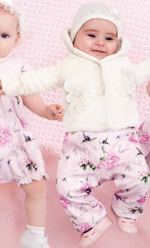
Olga, 7 months: Jacket, squ 29.67 Pants, squ 30.67 Knit Hat, squ 45.67 Booties, squ 836.43