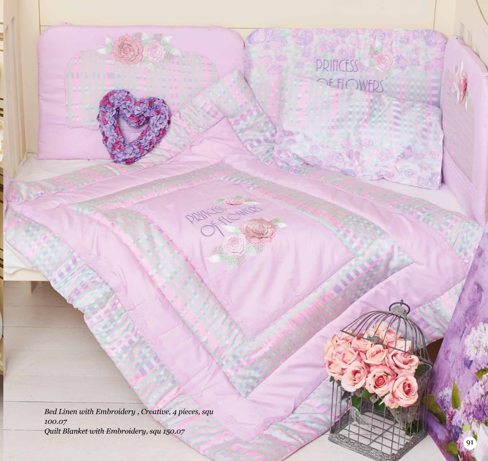
Bed Linen with Embroidery, Creative, 4 pieces, squ 100.07