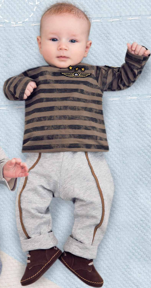
Eugene, 7 months: Stripe Hooded Sweatshirt, squ 39.68 Soft Pants with Buttons, squ 50.68 Booties, squ 833.43