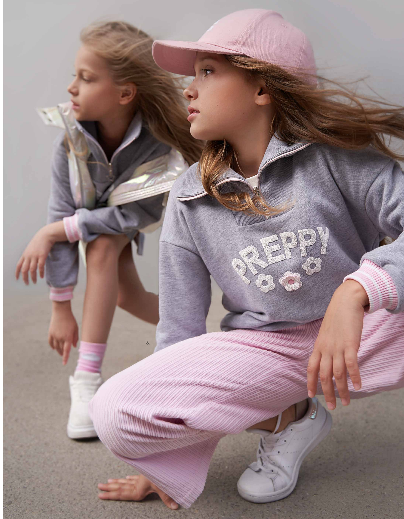
1. sku: 17.110 Mesh Sleeves Footer Hoodie-Dress | 2. sku: 49.110 Printed T-Shirt, sku: 08.110 Chain Decorated Pleated Skirt | 3. sku: 15.110 Shortened Combined Printed Sweatshirt, sku: 21.110 Free Cut Velvet Trousers | 4. sku: 01.110 Combined Decotared Bomber-Jacket, sku: 50.110 Decorated T-Shirt | 5. sku: 26.110 Pearl Organza Bomber Jacket with Decors, sku: 28.110 Printed Knitted Dress | 6. sku: 25.110 Tracksuit (Sweatshirt) with print.