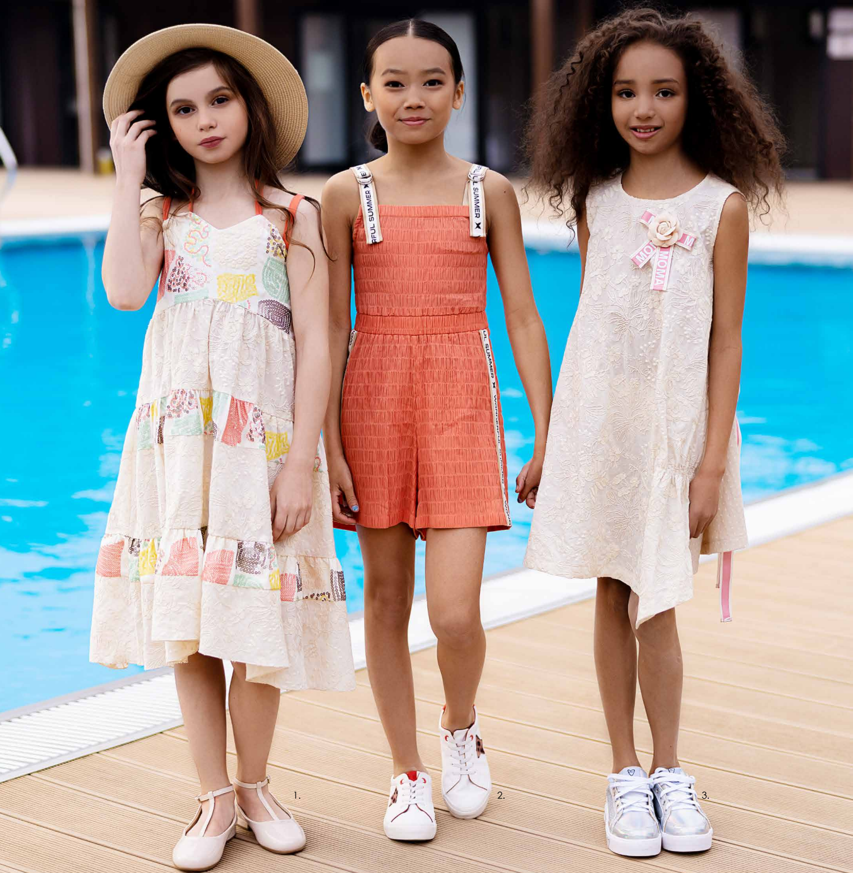
1. sku: 34.112 Sequins and Lace Decorated Dress, sku: 27.112 Straw Hat | 2. sku: 22.112 Muslins Jumpsuit with straps | 3. sku: 29.112 Decorated Muslins and Lace Dress 4. sku: 80.112 Kashkorse Crop-Top, sku: 78.112 Footer Culottes Pants | 5. sku: 08.112 Footer Sweatshirt, sku: 79.112 Kashkorse Shorts | 6. sku: 28.112 Braid Decorated Dress | 7. sku: 30.112 T-Shirt imitation Tunic, sku: 25.112 Leggins.

It's gonna be a hot summer soon! You can enjoy the sun and light breeze, swim, play with friends, eat ice cream and drink cold lemonade. To turn an ordinary summer day into a holiday, we suggest you throw a pool party!