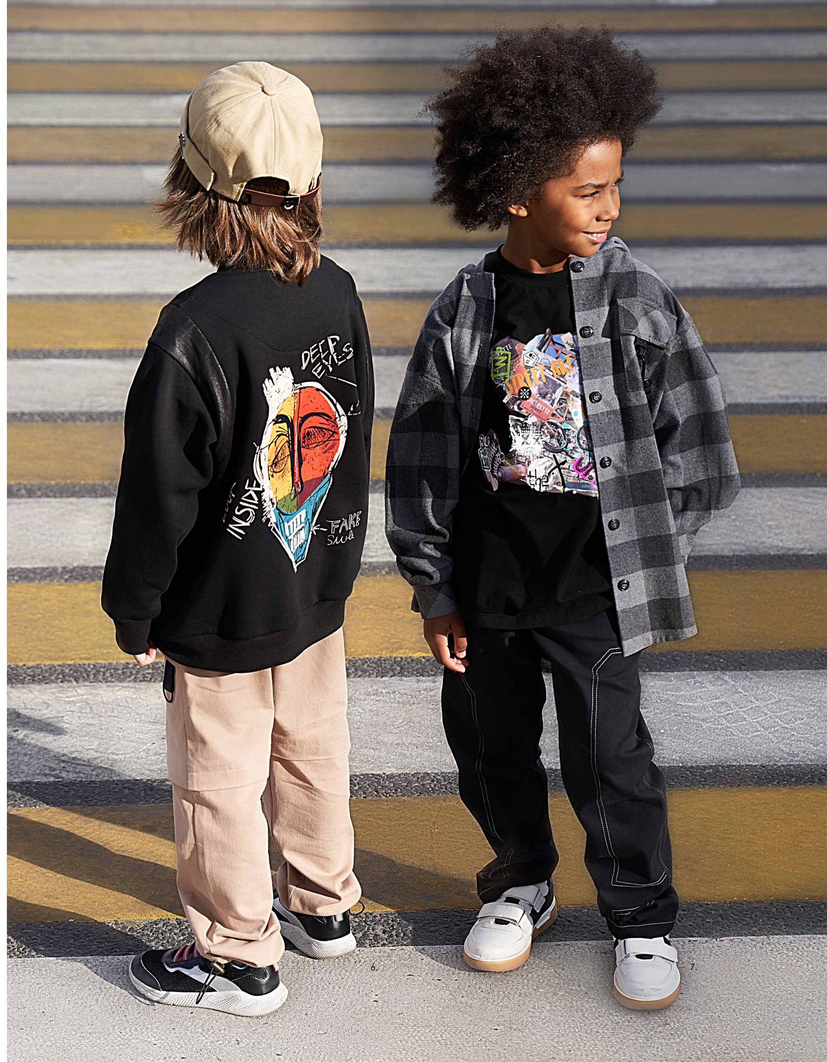
1. sku: 04.113 Stone washed Footer Printed Sweatshirt, sku: 07.113 Shorts | 2. sku: 13.113 Decorated and Printed T-Shirt, sku: 06.113 LS Tee, sku: 05.113 Stone washed Footer Decorated Shorts | 3. sku: 07.111 Denim Jacket with decors | 4. sku: 719.20 Decorated raincoat Jacket, sku: 16.113 Shirt, sku: 11.113 Decorated and Printed T-Shirt | 5. sku: 06.111 Decorated Footer SweatJacket, sku: 01.111 Decorated and Printed LS Tee, sku: 10.111 Twill Trousers | 6. sku: 06.111 Decorated Footer SweatJacket, sku: 10.111 Twill Trousers | 7. sku: 22.111 Checked Knitted Hooded-Shirt with print sku: 15.111 Applique Decorated T-Shirt, sku: 19.111 Denim Pants.