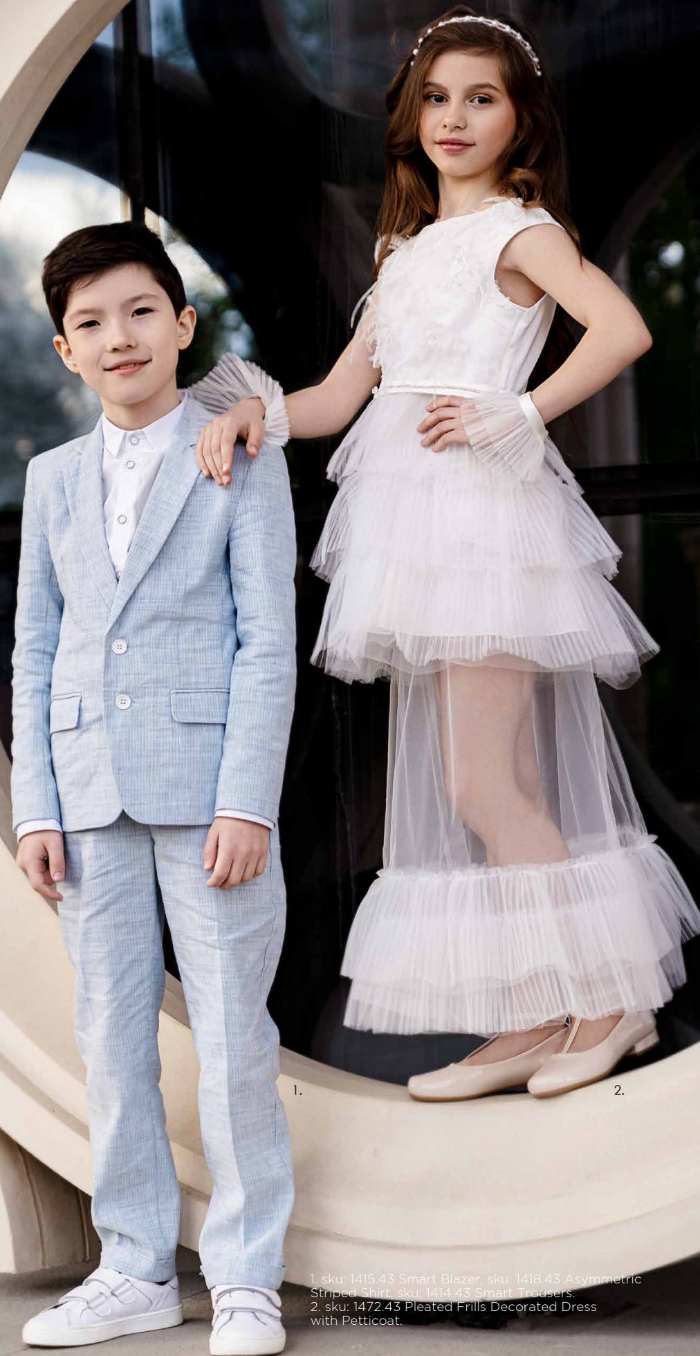
1. sku: 1415.43 Smart Blazer, sku: 1418.43 Asymmetric Striped Shirt, sku: 1414.43 Smart Trousers. 2. sku: 1472.43 Pleated Frills Decorated Dress with Petticoat.

Italian designer Giambatista Valli in his couture collections creates pastel looks filled with lightness and airiness. Take a closer look at knee-length dresses with a voluminous skirt and layered clothing models with draping.