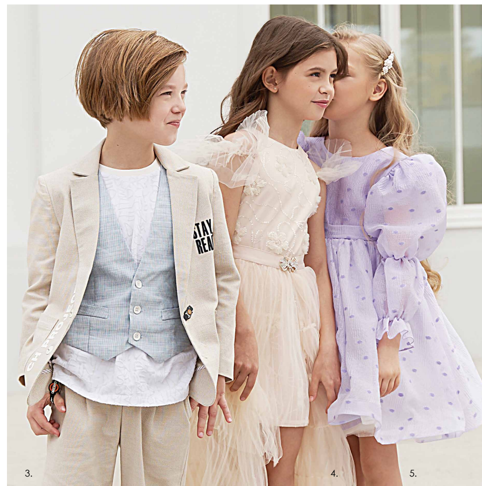
3. 4. 5.