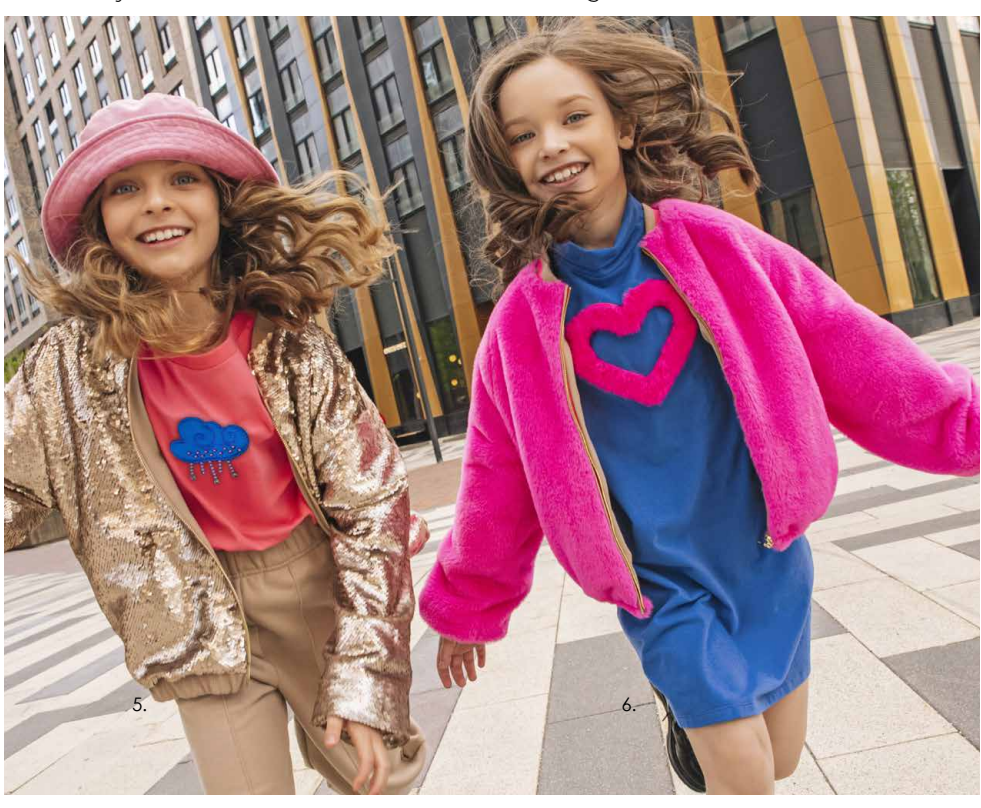
1. sku: 15.114 Knitted Dress | 2. sku: 26.114 Embroideried Sweatshirt, sku: 47.116 Patch Pockets Jeans | 3. sku: 35.114 Pleated Chiffon Dress | 4. sku: 105.114 Footer Sweatshirt, sku: 112.114 Pressed Mesh Skirt | 5. sku: 116.114 Sequins Bomber Jacket, sku: 65.114 Decorated T-Shirt, sku: 111.114 Elastic Waistband Jersey Trousers 6. sku: 117.114 Faux Fur Decorated Bomber-Jacket, sku: 14.114 Decorated Knitted Dress | 7. sku: 108.114 Brushed Effect Knitted Tracksuit (sweatshirt and pants) 8. sku: 29.114 Jersey Bomber Jacket, sku: 30.114 Jersey Skirt | 9. sku: 117.114 Faux Fur Decorated Bomber-Jacket, sku: 37.114 Printed Jersey Dress.

The trendiest shade of this season pink long-sleeve shirt. For those who is magenta. It's Pantone's «Color of The aren't afraid to experiment, Choupette's Year» and the main inspiration for the new designers recommend to wear a total Choupette collection. With magenta, you'll magenta look or combine it with electric blue or gold colors.