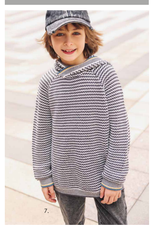
1. sku: 19.115 Corduroy Shirt, sku: 21.115 Elastic Waistband Jersey Trousersи | 2. sku: 12.115 Footer Hoodie | 3. sku: 755.20 Coat Jacket, sku: 19.117 Knitted Shirt, sku: 15.117 Footer Trousers | 4. sku: 20.117 Coated fabric Hooded Shirt, sku: 18.117 LS Tee, sku: 27.117 Footer Trousers | 5. sku: 27.115 Soft Shirt, sku: 11.115 Printed T-Shirt sku: 19.117 Knitted Shirt, sku: 27.117 Footer Trousers | 9. sku: 772.20 Plaid Shirt-Jacket, sku: 18.117 LS Tee, sku: 15.117 Footer Trousers